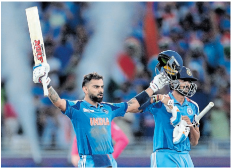
India's Virat Kohli celebrates after hitting four runs to reach his century.

Virat Kohli is more than 4,000 runs adrift of Sachin Tendulkar in the list of leading one-day international scorers but former Australia captain Ricky Ponting believes the 36-year-old can still surpass the Indian maestro if he remains hungry. Kohli went past 14,000 runs in the format with an unbeaten 100 in India's victory over Pakistan in the Champions Trophy on Sunday and only has Tendulkar (18,426) and Sri Lanka's Kumar Sangakkara (14,234) ahead of him. Ponting, who is fourth in the list with 13,704 runs, backed the Indian batsmen to keep adding to his tally of 14,085. "With someone like Virat, you never write him off, because I'm sure he would be motivated by that [achieving the record]," Ponting said on the ICC Review Podcast. "Now that he's gone past me and only two ahead of him, I'm sure he wants to give himself the best chance to be remembered as the all-time leading run scorer in the game. "So, as long as the hunger's there ... physically, he's probably as fit as he's ever been and works exceptionally hard on that side of his game. If the hunger's still there then I'm never going to write him off." Ponting said it would not be long before Kohli scores the 150 runs he needs to go past Sangakkara, suggesting he