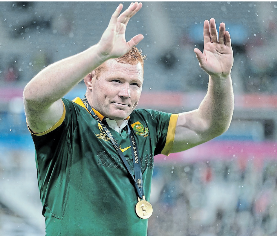
Steven Kitshoff waves the fans after SA's victory against New Zealand in the Rugby World Cup 2023 final at Stade de France in Paris.